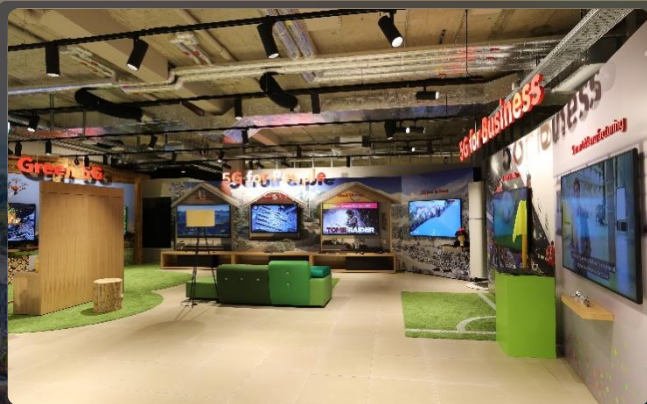
5G Joint Innovation Centre Zurich, Switzerland